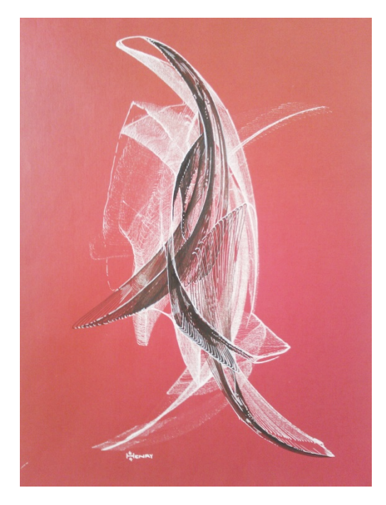
Figure 3. Untitled, 1964. Executed using Drawing Machine Two; Indian inks in tube pens on Fabtex paper; hand-embellished

These unique machine-generated drawings (Fig.3) are the only permanent reminders of the 'performative trace' of what were once very busy machines which for over ten years whirred away in the corner of Henry's study in Manchester, whilst he sat marking student papers at his desk. Today, eerily motionless, random machine parts are all that remain of these once vibrant machines.