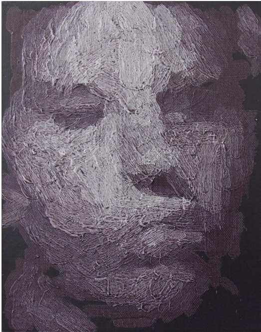
Figure 4. Painting from the series: Paul's Memories, 2013

Paul is designed to limit complexity, and only to fulfill its function, drawing. As such it is composed of a three-jointed planar arm with an extra joint to raise and lower the pen in contact with the paper and an actuated pan and tilt camera used as its eye. Both arm and eye are bolted to a single school desk where the drawing paper is attached using pins (fig.2).