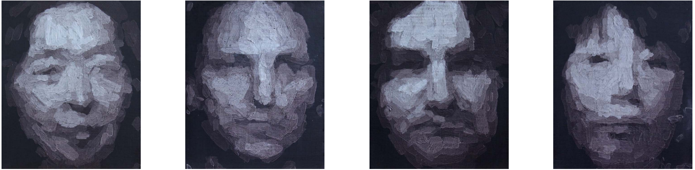
Figure 1. Paintings from the series Paul's Memories, 2013

the artwork was an important feature 4 . Later, in the 1980's, the advent of evolutionary art with the work of Karl Sims [25] and William Latham [28], and later works linked to artificial life such as those of Penousal Machado [15], Leonel Moura [18] or Rui Antunes [1].