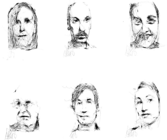
Figure 5. Sketches by Paul, 2011

ence, we have noticed that one of the interesting properties of the produced portraits is that they are perceived, considered and appreciated as drawings. When observing a series, Paul's drawings are recognised as drawn by the same author meaning that they display an autographic style. Contrary to other computational systems that produce drawings from photographs such as Alkon-I [30, 29], drawings produced by Paul do not display the same serial uniformity of treatment (fig.5).