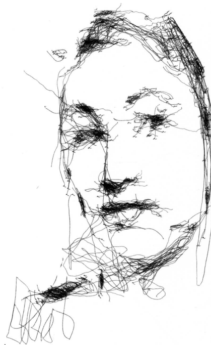
Figure 3. Sketch by Paul, 2011

As for the perceived agency of the system, studies have shown that humans have a tendency to consider robots as social agents, as having personalities and agency [3, 4]. It is likely that with the knowledge that an artwork has been produced by a robot, the observer will be able to consider the robot as the originator of the intentions that led to the artworks’ creation, as the artist.