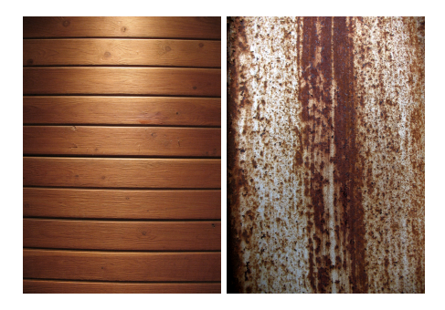
Figure 2. Two textures from ANGELINA-5's repository of over 600.

Once ANGELINA-5 has a theme word it attempts to expand the theme using word association databases<sup>4</sup>. We plan to replace this technique with a more relevant topic association approach in future, but for most applications word association provides a reasonable set