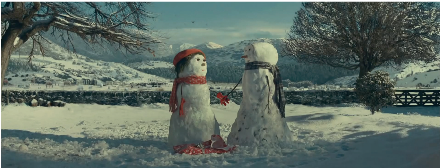
John Lewis: is renowned for running highly emotional TV advertising, such as 'The Journey', in which music plays a central role